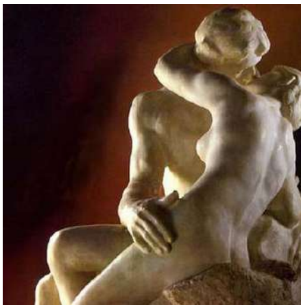
Detail from Rodin's sculpture, "The Kiss".

When you GIVE YOUR BODY you also GIVE YOUR FERTILITY :