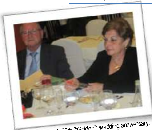
Celebrating their 50th ("Golden") wedding anniversary.

When a couple gets married, as we have already seen, they tell one another: "I promise to be true to you in good times and in bad, in sickness and in health. I will love you and honor you all the days of my LIFE ". How wonderful!